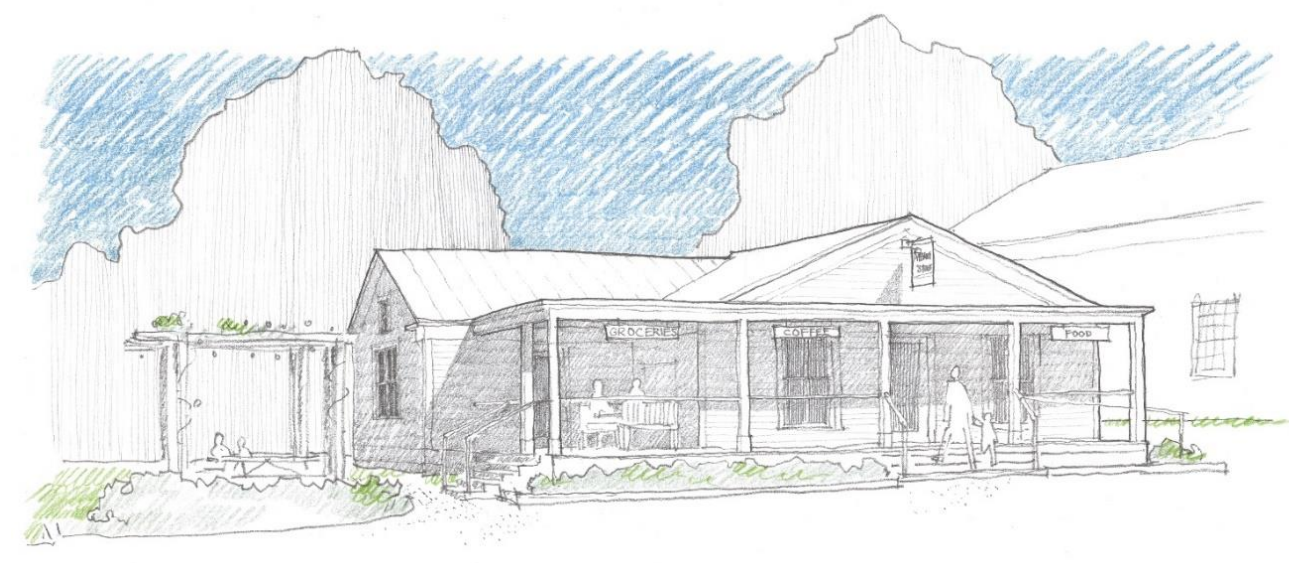
Albany General Store